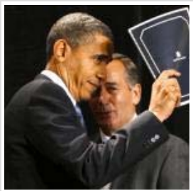
Obama Gives the Thumbs-Up on Detention of Domestic Terror Suspects as New World Order Set to Gain ...