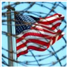
New Amendments Introduced To Halt Indefinite Detention of Americans