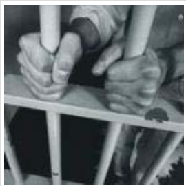
Crushing the Disinformation Surrounding Indefinite Detention of Americans Under the NDAA