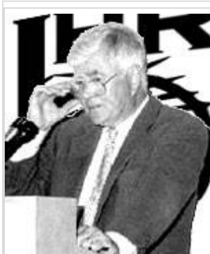
Paul "Pete" McCloskey, former Republican Congressman from California and decorated US Marine Veteran

Findley writes that Ostrovsky's statements were relayed to Findley's friend and former colleague Paul "Pete" McCloskey , a prominent former Republican Congressman from California who had recently been named by Bush to the National and Community Service Commission.