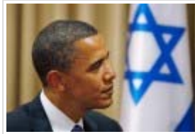
Obama for President of Israel?