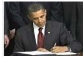
Obama's Message to Tehran: Direct War Against Iran on Back Burner...for Now?