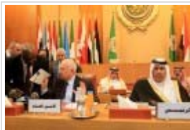
Sharp-Elbowed Politics in the New Arab World