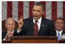
Obama: All options on the table on Iran