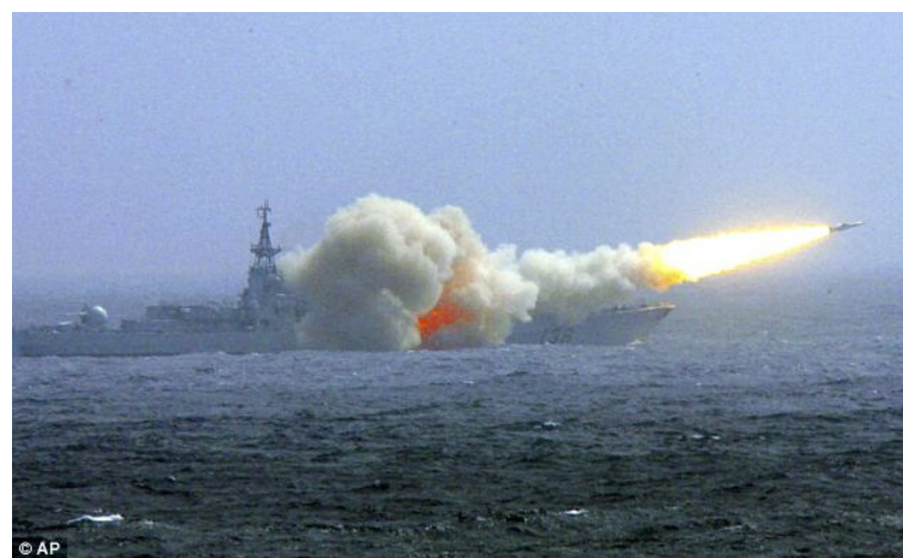
Cause for conflict: China and the U.S. engaged in a military standoff over space missile tests

And despite being threatened with military action in 2007 by then U.S. Secretary of State Condoleezza Rice, China carried out another missile test only last year.