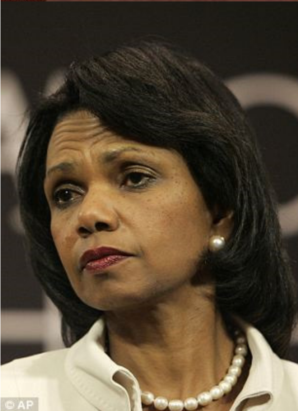
Warning: China's president Hu Jintao (left) angered the U.S. by testing an anti-satellite missile, with officials working for then Secretary of State Condoleezza Rice threatening Beijing with military action

'The United States reserves the right, consistent with the UN Charter and international law, to defend and protect its space systems with a wide range of options, from diplomatic to military.'