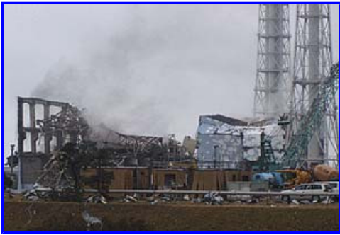
The radioactive smoke rises from destroyed Fukushima reactors TEEOCO-AP-295