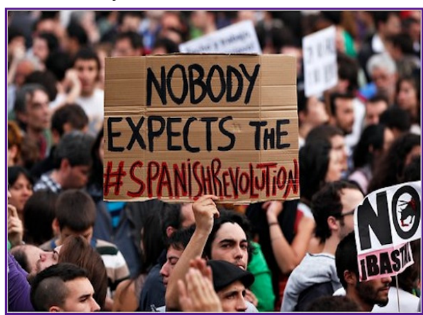
Spaniards protesting the handling of their country's economic crisis have vowed to keep their tents in central city squares this week. A wave of similar protests has spread to other major European cities.