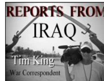
Reports From Iraq

Oregon State Hospital Hopes to Unite Families With Cremated Remains of Past Patients