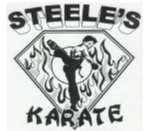
In Salem Sign Up Now!