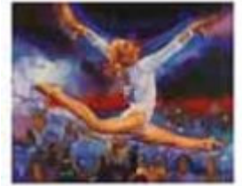
Salem Gymnastics Center