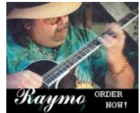
Hear Raymo's Songs