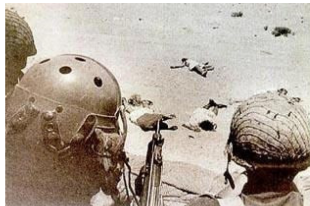
Zionist Gunzels Slaughter A Village - (Note: See

Emanuel's father Benjamin was part of the Israeli assassin team that murdered Sweden's Count [Folke] Bernadotte in '48. Bernadotte was the UN envoy in Palestine who sought to find a solution to the UN Partition Plan that gave Palestinian land to Jews from "beyond the pale."