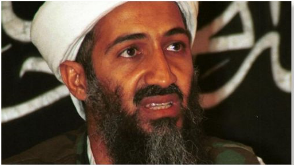
Right ear showing the same flattened helix

It's pretty astounding that the CIA would be so cavalier as to release videos that can so easily be proven to feature someone other than the real Osama bin Laden. Then again, perhaps this is indicative of the contempt with which the CIA and US government consider the general US, and to a lesser extent world, public. I think we can safely assume that the US government and all of those behind the phony 'war on terrorism' (which is clearly a global war of imperial conquest) and the 9/11 attacks believe that there is little if anything that the public will not accept as long as it comes from official sources. So far, the public has done nothing to suggest that this belief is ill-founded.