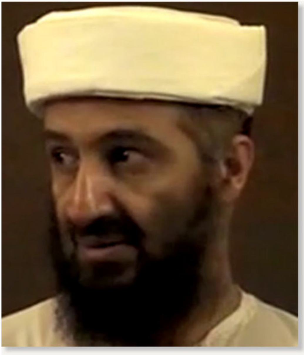
A rather petite shell-like ear for a 'terror mastermind'