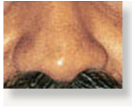
The real bin Laden's nose