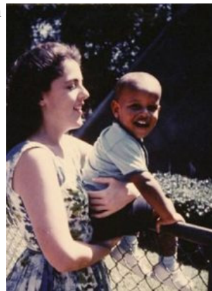
Young Barack Obama with his mother