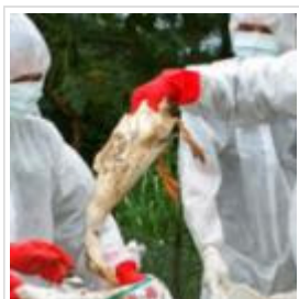
Korean Quarantine: Bird Flu Found