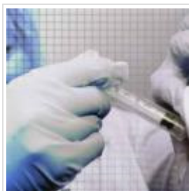
H1N1 Vaccine Linked to 700 Percent Increase In Miscarriages