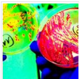
E. Coli Outbreak a Massive Cover-Up?