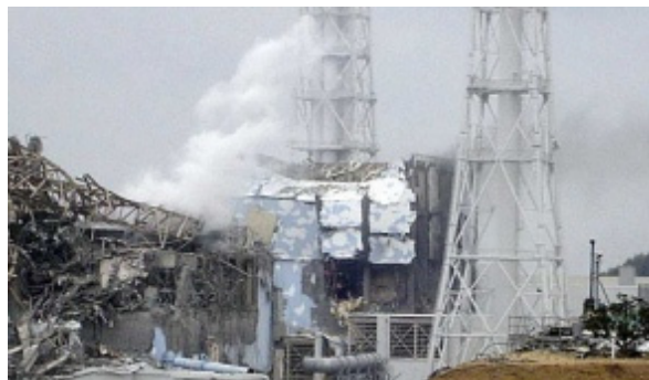
The damaged No. 4 unit of the Fukushima Dai-ichi nuclear complex in Japan, on Tuesday March 15, 2011.

Magna BSP set up the security system about a year ago at the facility, which suffered extensive damage after the recent earthquake and tsunami, with particular concern over radiation leakage from the reactors at the site.