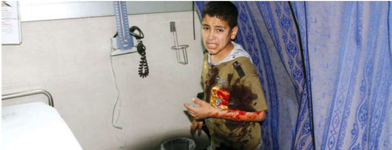
Image from Gaza April 8 2011 during the Israeli airstrike.