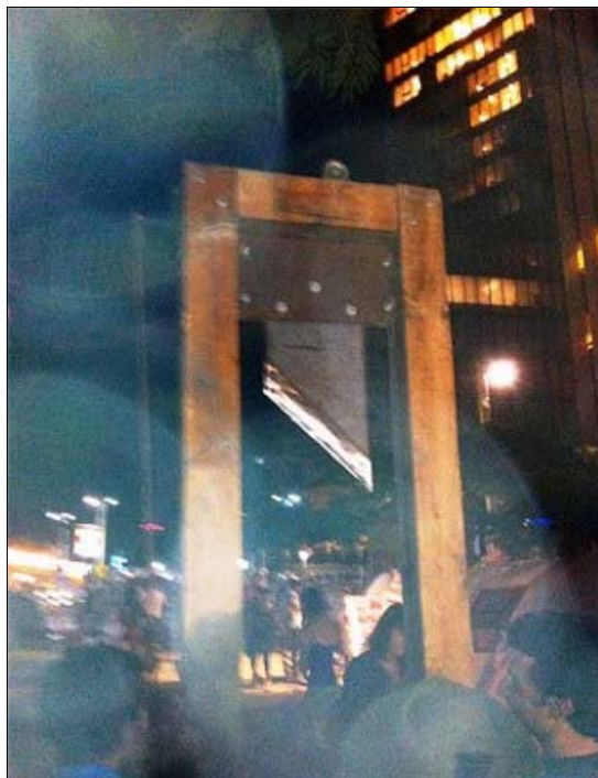
Guillotine in Tel Aviv | Placed during the August 2011 protests

How would the Israeli Administration react to the guillotine? Is Netanyahu shaving his neck more carefully these days? There is no doubt HaAgaf HaYehudi (The Jewish Department of the Shin Beth ) is working as pestilent cockroaches among the protesters. They are watching out for emerging leaders, surrounding them, illegally collecting and falsifying evidence on them, giving sabotaging advice, and in general doing everything the people never allowed their government to do. As of now, the police and the army would be kept as a last resource. Netanyahu would try to disguise the attempt to dismantle the protests as a natural event since it is vital for Israel to keep its most valuable secret hidden from its citizens. They should not know they live in a police state. The Coca-Coma show must go on.