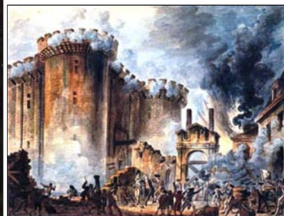
Marie Antoinette | Prise de la Bastille