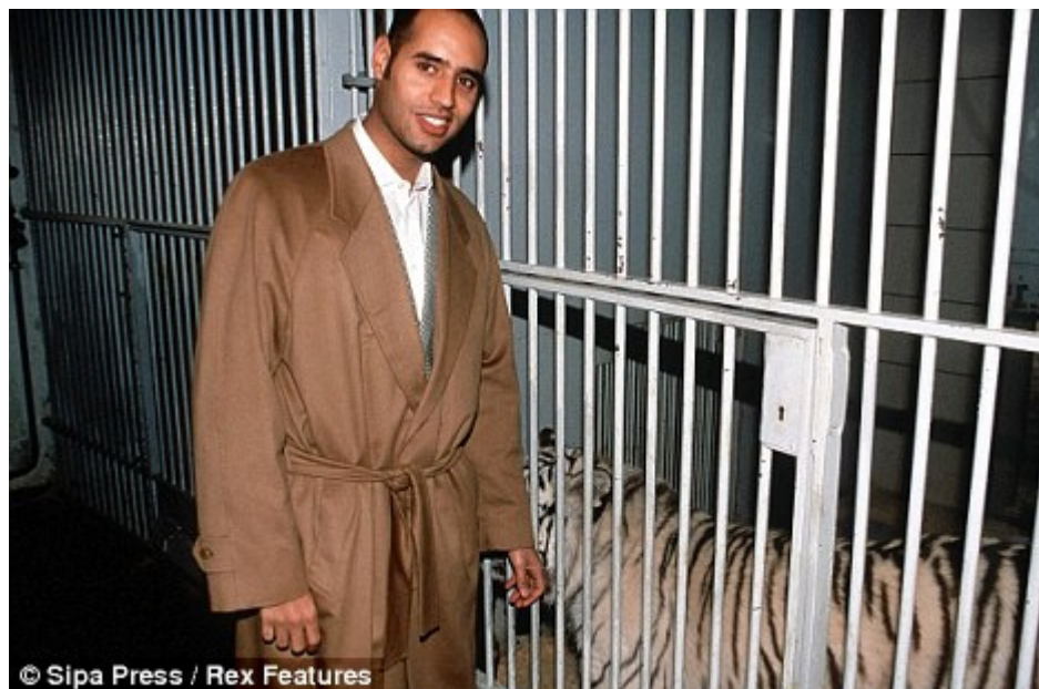
No pussycat: Colonel Gaddafi's son Saif, long seen as the dictator's most likely heir, keeps pet tigers at his Tripoli villa

He blamed drug addicts, drunks and foreign agents for fomenting the violence now coursing through the land where he and his family once had an iron grip. There was no hint of contrition. Not once did he apologise for the countless deaths inflicted by the soldiers and henchman of his father's bloody regime.