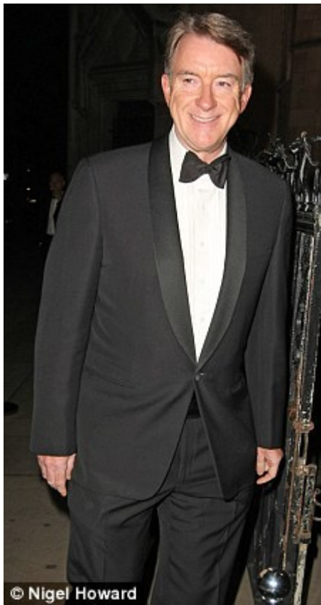
Powerful friends: Saif is said to have relations with Prince Andrew, left, and Peter Mandelson, right

He is an accomplished amateur artist and an architect with his own practice, although his wealth is said to come from interests linked back to Libya's national oil company. Certainly, he is rich. By way of diversion, Saif likes to romp with his pet tigers.