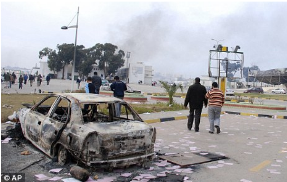
Crumbling: protesters in Libya's second city Benghazi, where they are said to have overwhelmed Gaddafi's supporters

Deripaska, it will be recalled, was part of the infamous summer gathering at the Rothschild house on Corfu in 2008 when Mandelson and George Osborne, then chancellor-in-waiting, were guests. Saif has also stayed with the Rothschilds on Corfu and, on a separate occasion, met Mandelson there.