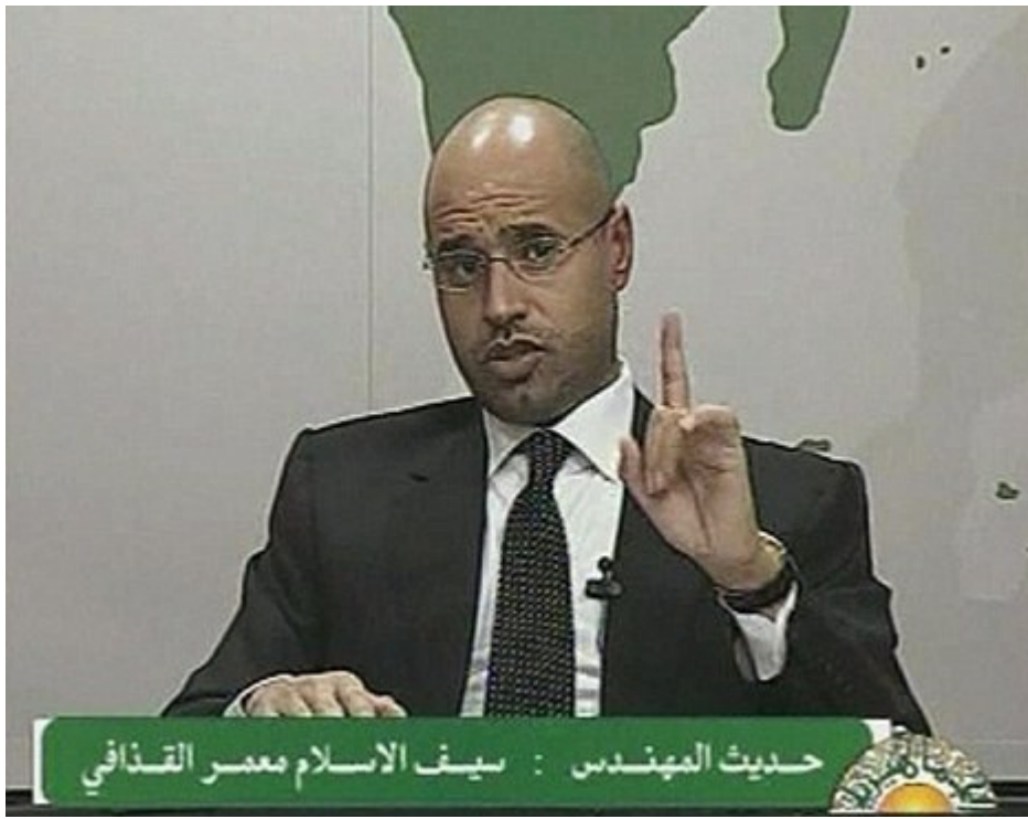
'Rivers of blood': Saif warned opponents of violent retribution earlier this week

And yet, with his impeccable English and flawless manners, 38-year-old Saif Gaddafi has long been regarded as the acceptable face of the Gaddafi clan.