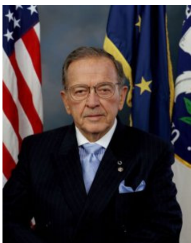
Senator Ted Stevens