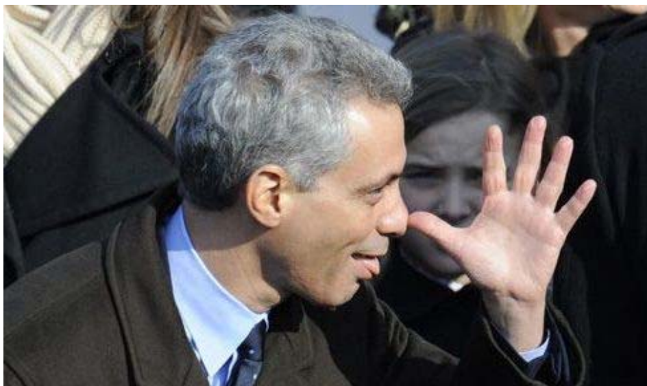
Rahm Emanuel, President Obama's chief-of-staff, is seen here at the inauguration. Emanuel was President Clinton's special adviser in the White House and the key person who pushed the disastrous NAFTA through Congress during Clinton's first year in office.

What Americans are reaping in 2009 are the real economic consequences of that "giant sucking sound" that the anti-NAFTA candidate Ross Perot warned of during the presidential debates of 1992. Seventeen years later, however, no one is laughing about Perot's phrase that he used to describe what NAFTA and other free trade agreements would do to the American economy.