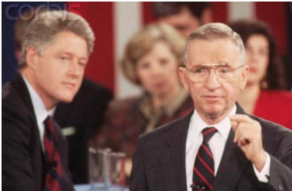
H. Ross Perot ran a valiant campaign as an anti-NAFTA independent candidate to protect American jobs, our manufacturing sector, our way of life and national prosperity. Clinton won and the American people lost.

Converse sneakers are no longer even made in the United States.