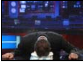
This Week In Green: Jon Stewart's Pie...