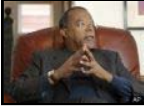
The Unteachable Lesson: Can We Learn From...