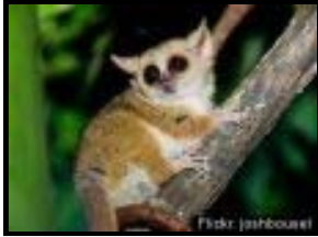
10 of Nature's Tiniest Animals (PHOTOS)