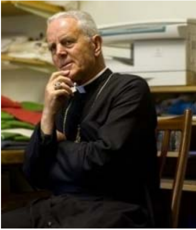
Bishop Richard Williamson

So, why is the Holocaust such a big deal? Because it's a major leg propping up the New World Order and the people behind the curtain — no doubt about it. They know that if you start asking questions about any of this, soon it will lead to a whole helluva lot more. And it's so easy to see all the reasons (below), that they've pushed this version of history on America and the White countries of the West — all the while knowing how much outrage the public would have for being lied to.