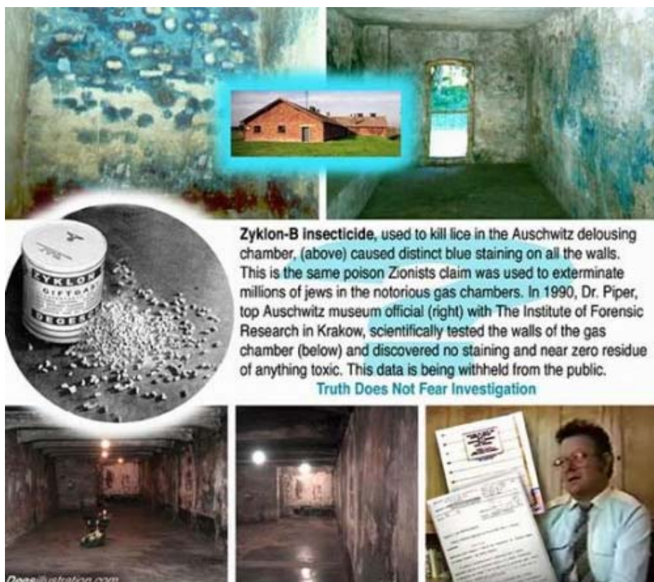
Zyklon-B insecticide, used to kill lice in the Auschwitz delousing chamber, (above) caused distinct blue staining on all the walls. This is the same poison Zionists claim was used to exterminate millions of jews in the notorious gas chambers. In 1990, Dr. Piper, top Auschwitz museum official (right) with The Institute of Forensic Research in Krakow, scientifically tested the walls of the gas chamber (below) and discovered no staining and near zero residue of anything toxic. This data is being withheld from the public. Truth Does Not Fear Investigation