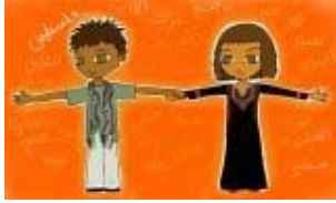
Palestinian Child Sponsorship