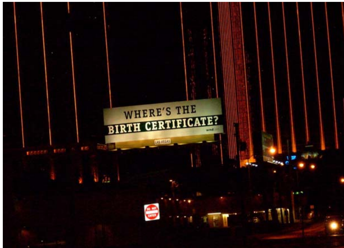
"Where's The Birth Certificate?" billboard at the Mandalay Bay resort on the Las Vegas Strip

The campaign followed a petition that has collected more than 450,000 signatures demanding proof of his eligibility, the availability of yard signs raising the question and the production of permanent, detachable magnetic bumper stickers asking the question.