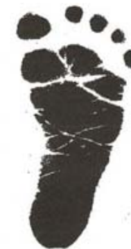
Is this the footprint of baby Barack Obama?

Want to know for certain where Obama was born? Demand the truth by joining the petition campaign to make