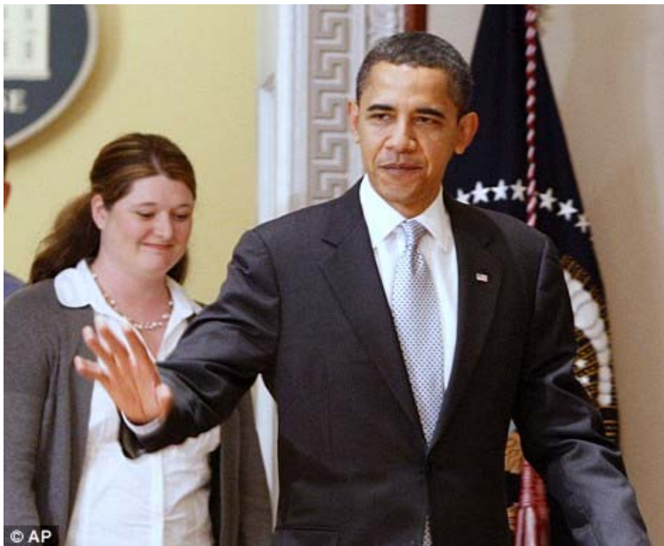
President Barack Obama, followed by unnamed taxpayers, arrives at the White House to speak about the U.S. tax code yesterday

It showed photographs of Mr Obama, U.S. House Speaker Nancy Pelosi and Senate Majority Leader Harry Reid wearing pirate hats.