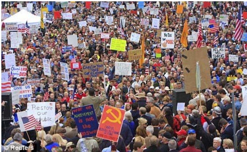
Thousands rally at the Tennessee State Capitol at the Tax Day Tea Party in Nashville, Tennessee yesterday as the backlash against Mr Obama's federal spending grows

Despite his pullback, Mr Perry's star was rising in conservative America yesterday as right-wing supporters struggling for a voice under Mr Obama found a new icon.