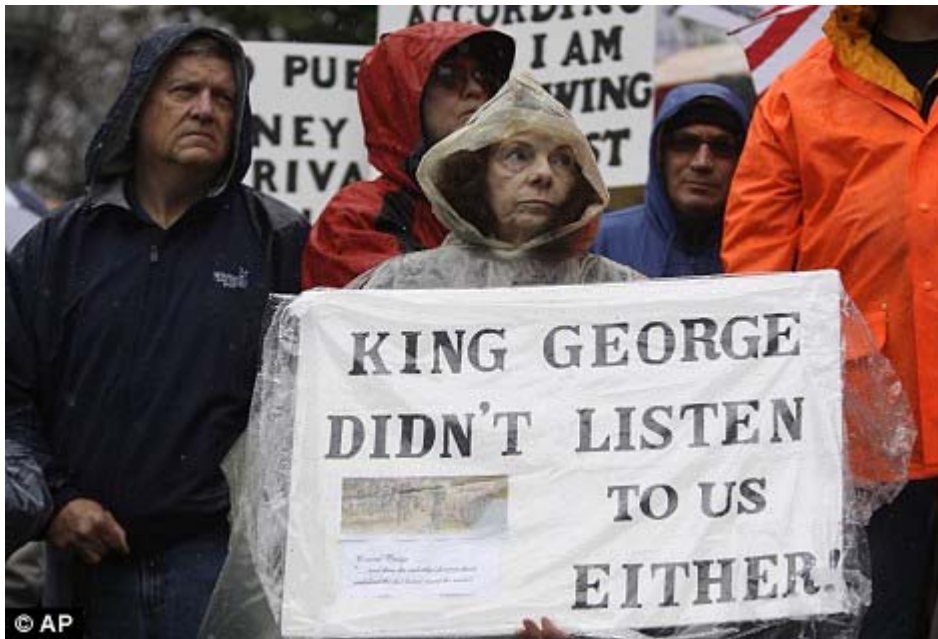
Protesters in Harrisburg, Pennsylvania invoked the Boston Tea Party of 1773 as they stood in the rain yesterday

That is one of the highest percentages since the annual poll began in 1956.