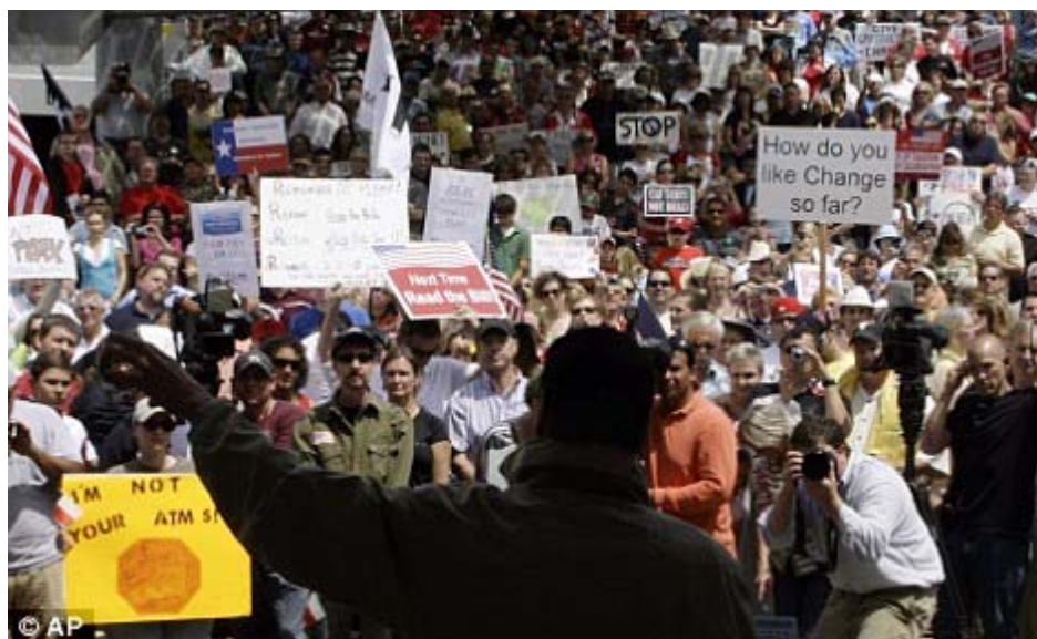
'How do you like Change so far?': Texan governor Rick Perry, foreground, threatens Texan independence at the 'Don't Mess with Texas' tea party protest yesterday

He later backtracked, telling reporters later that there was 'absolutely no reason to dissolve [the Union]'.