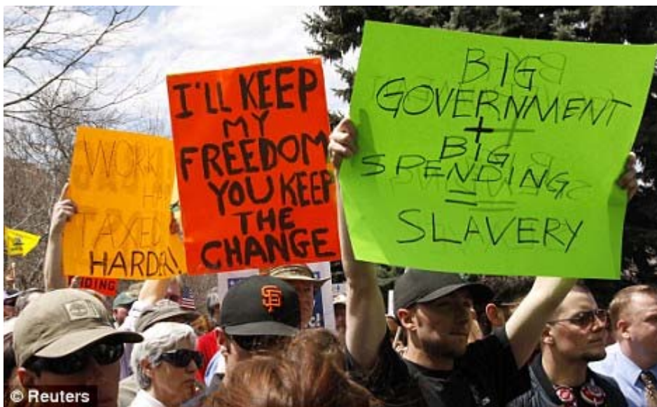
Obama backlash: Protesters in Denver, Colorado yesterday

The protests came as tax forms showed today that Mr Obama and his wife Michelle took home a combined income of more than $2.5million last year.