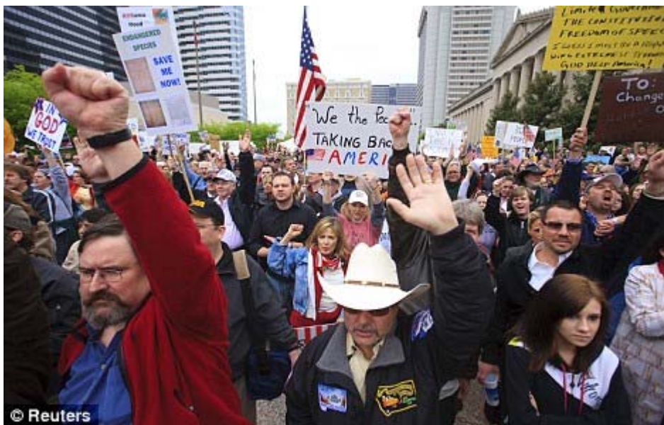
More protesters in Tennessee. Protests were also held in Washington, Chicago and Boston, loosely inspired by the 1773 Boston Tea Party rebellion against British colonial taxes

However he rushed to add that he saw no reason why Texas would do that.