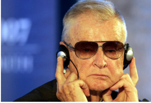
Zbigniew Brzezinski, a well-known policy expert whose opinions reportedly influence President Barack Obama's foreign policy, says Israel must be militarily stopped, should it launch an attack on Iran.

After talk of an Israeli airstrike on Iranian nuclear sites was renewed after months, former National Security Adviser Zbigniew Brzezinski says the US should warn Israel that its jets will be shot down on their way to the Iranian targets.