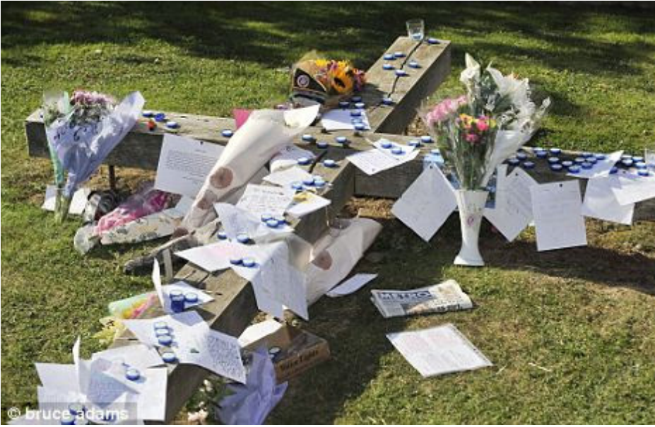
A large wooden cross lies outside the school attended by Natalie. It is covered by messages from fellow pupils and candles

A spokesman for Coventry Primary Care Trust said: 'An urgent investigation has been launched and while we wait for the results from the post mortem all vaccinations using the drug have been temporarily stopped'.