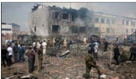
Car bomb kills at least 18 in Russia's south