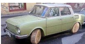
Wooden Wheels (photos)