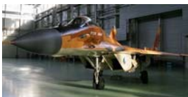
Welcome to MiG Design Bureau