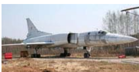
TU-22M-3 Aircraft (photos)