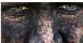
Miners in Afghanistan (photos)