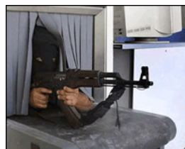
Phantom menace for Russia GeorgiaTimes

"Power plant disaster won't cause serious energy shortages"