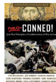
"Neoconned" and "Neoconned Again", two new collections of essays