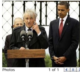
Photos 1 of 1 Elie Wiesel makes a speech while US President Barack Obama stands by his side.