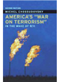
America's "War on Terrorism", book by Michel Chossudovsky

:: The views expressed in this article are the sole responsibility of the author and do not necessarily reflect those of this website.