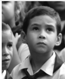
Elian Gonzalez View and ORDER more photos.