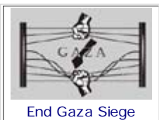
End Gaza Siege

:: Uruknet on GoogleNews :: Uruknet su GoogleNews Italia