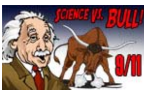
The REAL 9/11 truth movement