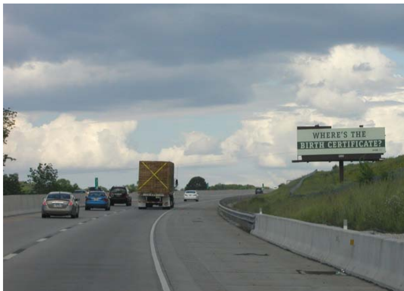
"Where's The Birth Certificate?" billboard in Pennsylvania

WND has reported that among the documentation not yet available for Obama includes his kindergarten records, his Punahou school records, his Occidental College records, his Columbia University records, his Columbia thesis, his Harvard Law School records, his Harvard Law Review articles, his scholarly articles from the University of Chicago, his passport, his medical records, his files from his years as an Illinois state senator, his Illinois State Bar Association records, any baptism records, and his adoption records.