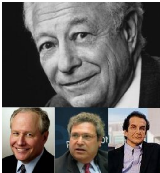
Top Irving Kristol (father). Bottom left William Kristol (son) middle Robert Kagan and right Charles Krauthammer