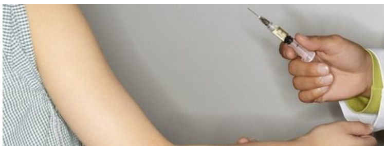
Parents should be informed about the possible side effects / pic posed by models

Authorities in the UK should be on the alert because its sister vaccine, Gardasil, used in America, has already been associated with 32 deaths, she said.