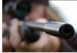
Israeli "hits" are meant to deprive Tehran of key technical skills at the heart of the nuclear program, sources say.

Iran has denied the claims, saying that the Israeli intelligence agency is basically incapable of running such assassination operations inside Iran.