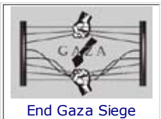
End Gaza Siege

:: Uruknet on GoogleNews :: Uruknet su GoogleNews Italia