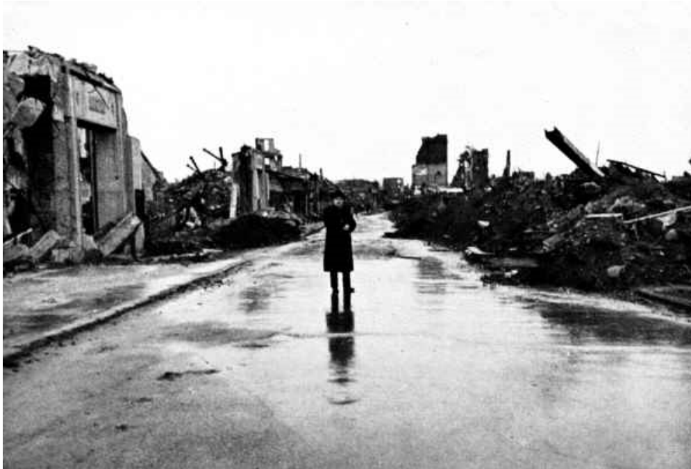
High Street, Düren, June 1946. Shown is Victor Gollancz