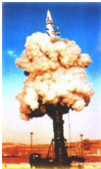
The ASBM is said to be a modified DF-21

Supporting the missile is a network of satellites, radar and unmanned aerial vehicles that can locate U.S. ships and then guide the weapon, enabling it to hit moving targets.