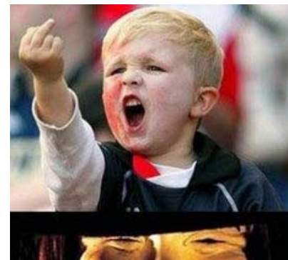
And Take Your Delusional Elitist Neocon Horseshit Somewhere Else... This Is America!