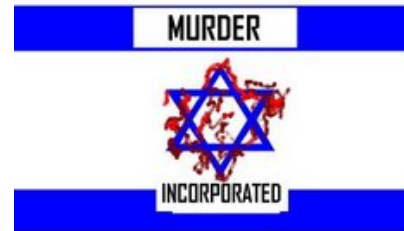
A Liberal White Boy Salute To Leo Strauss