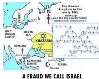
Dig Up Some Khazar Bones