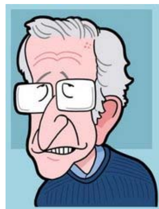
Advertising...Cards and Prints

Chomsky, A Man And His Linguistics...The Interview Noam Chomsky Didn't Want To Do