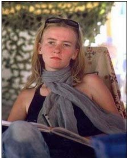
Rachel Corrie Palestinian Human Rights Advocate