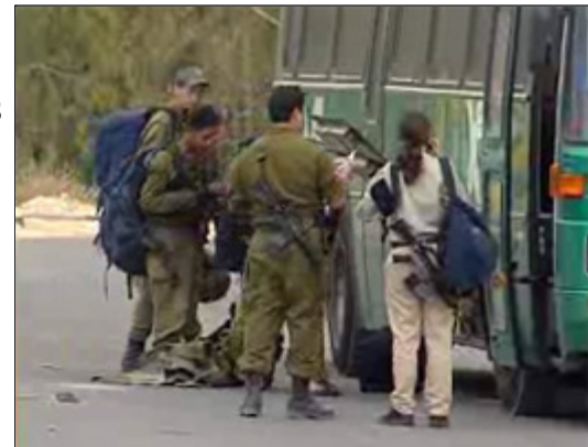
Merkavim's promotional video shows Israeli soldiers boarding an armored bus.

According to Merkavim, in the video promoting the bus, the Mars Defender "looks like any other modern bus," but it is "the world's most armored bus." Indeed, the company calls it "the bus that saves lives!" As the narrator explains that the bus is "designed to safeguard the most precious cargo," the camera pans over Israeli soldiers lining up to board the bus and on patrol with their