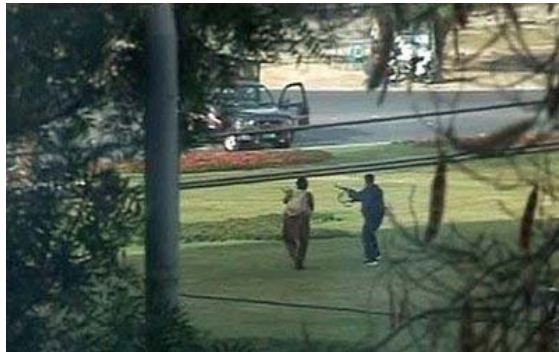
Attack on a bus carrying a cricket team in Pakistan.

1. Reportedly, certain security services are trying to break up Pakistan, just as they broke up Yugoslavia.