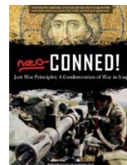
"Neoconned" and "Neoconned Again", two new collections of essays