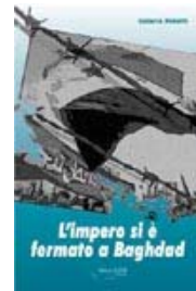
L'Impero si è fermato a Bahgdad, by Valeri Poletti

:: [uruknet] щелкните здесь для машинный перевод в русского