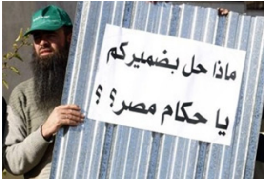
A protester holds a symbolic piece of metal wall with a placard written in Arabic: "What is on your consciences, Egyptian leaders?"

The United States has offered its full-fledged support for the building of a wall by Egypt to disrupt the Gaza Strip's lifeline that moves basic items underground past the Israeli-imposed blockade.