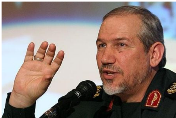
Brigadier General Yahya Rahim-Safavi