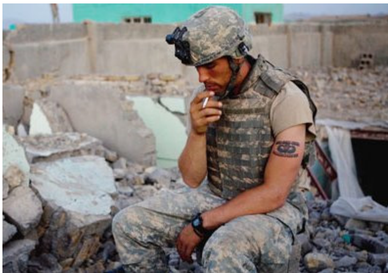
An American soldier in Afghanistan fighting for the Rothschilds' Zionist state of Israel

The controlled media is lying through its teeth to the American people just like the C.I.A., the F.B.I., and the so-called "elected" members of Congress and the U.S. government. Any person or agency who is party to deceiving the American people is clearly not on their side. These liars are the domestic enemies of the American republic. To deceive the people into sending their sons, husbands, fathers, and daughters to fight wars of aggression is criminal and treasonous.