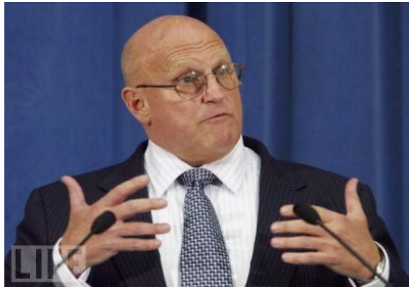
U.S. GANGSTER DIPLOMACY – U.S. Deputy Secretary of State Richard Armitage threatened to bomb Pakistan "back to the stone age" unless it