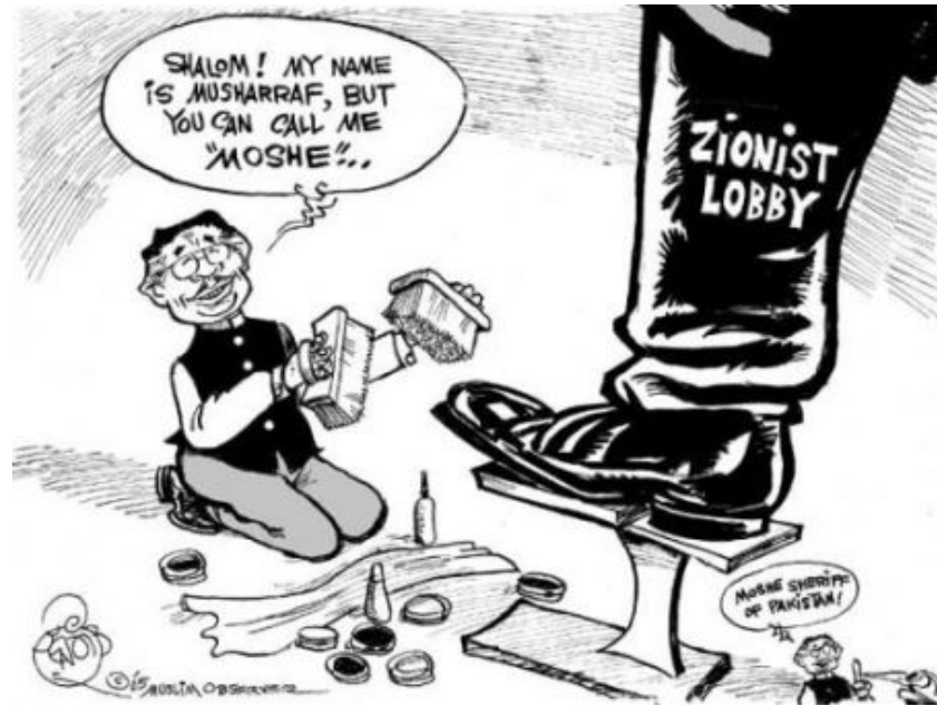
A cartoon depicts the Pakistani military chief as a Zionist stooge

1,680 kilometer gas pipeline will supply 3.2 billion cubic feet of natural gas per day (much of this gas will come from Israeli/Mossad-owned gas fields in Turkmenistan, meaning immense profits for the Mossadniks who pulled off 9/11)