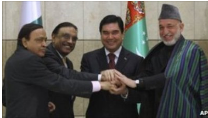
Indian energy minister Murli Deora, Pakistani President Asif Ali Zardari, Turkmen President Kurbanguly Berdymukhamedov and Afghan President Hamid Karzai after signing TAPI agreement in Ashgabat, Turkmenistan, 11 December 2010