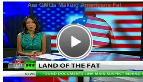
Your NaturalNews.TV video could be here. Upload your own videos at NaturalNews.TV (FREE)