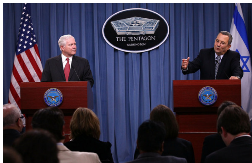
Robert Gates and Israel's Minister of Defense Ehud Barak, Press Conference, April 27, 2010