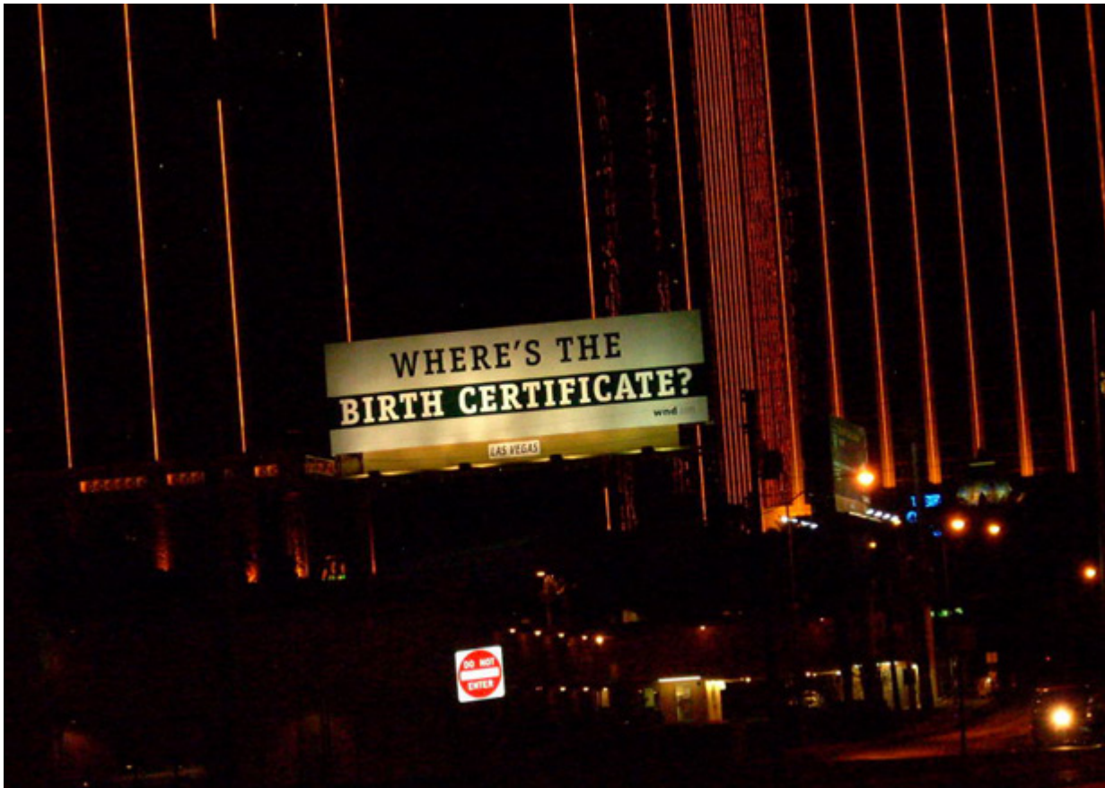
"Where's The Birth Certificate?" billboard helps light up the night at the Mandalay Bay resort on the Las Vegas Strip.

The White House has not replied to numerous requests for comment.