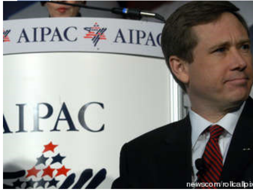
Rep. Mark Kirk (R-IL)