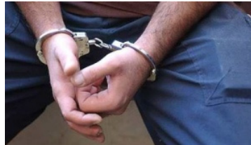
Illustration. Police arrested Monday 24-year-old suspected of sexually abusing young girls.

An Israeli man was arrested Friday for allegedly running an organ trafficking network in the Ukraine, Army Radio reported.