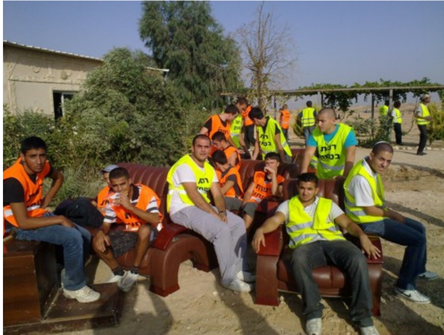
(Moments before the destruction of the Bedouin village of al-Arakib, Israeli high school age police volunteers lounge on furniture taken from a family's home; photo credit: Ata Abu Madyam, Arab Negev News; click image to make larger)

Share / Recommend - Comment - Print - Saturday, Jul 31 2010, 9:06PM