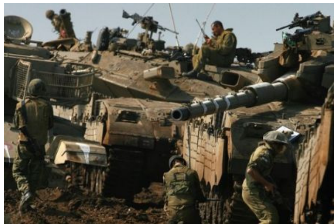
Israeli tanks, file photo